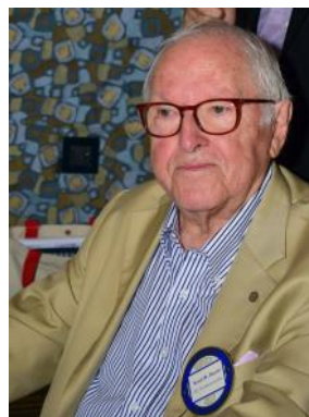
Happy 90th Birthday