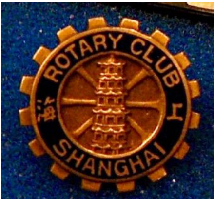
Original RCS Member Pin, 1920s