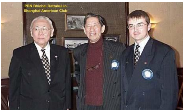
PRN Bhichai Rattakul in Shanghai American Club, 2000